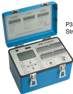
P3 Strain Indicator

Micro-Measurements offers a wide variety of instrumentation specifically designed and optimized for strain measurement. Simple Strain Indicators are available for high-accuracy static measurements. Signal Conditioning Amplifiers accept direct strain gage input and provide a conditioned signal output in the \pm 10 V range. Data Systems accept direct strain gage input and provide reduced data, already in engineering units of strain and/or stress.