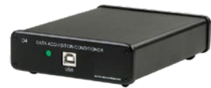
D4 Data Acquisition Conditioner