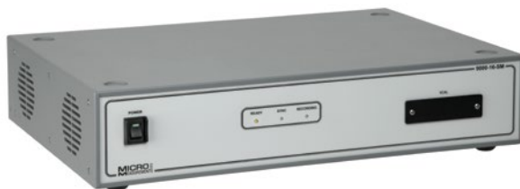
System 9000 Data Acquisition