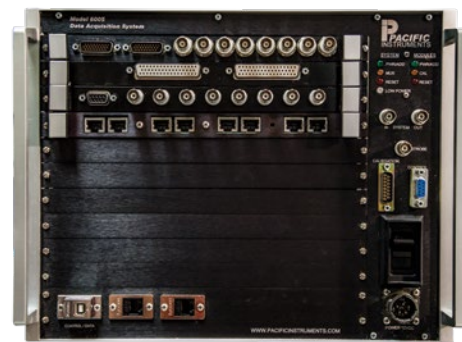
Pacific Instruments Series 6000 Data Acquisition System