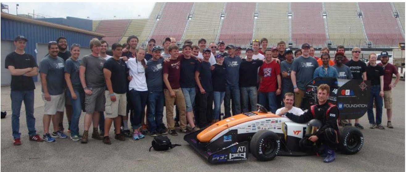
The 2014-2015 Virginia Tech Motorsports Formula SAE Team and the car used for testing

The Virginia Tech Motorsports Formula SAE Team developed MATLAB code to evaluate the loadings acting through the suspension. The team has never fully validated the loading seen during driving conditions. Validation of the Suspension analyzer code is the main goal of using the Micro-Measurements' strain gages. By validating this model, it assures the team that the design choices made using simulation correlate with experiment and are representative of the operational load scenarios used for designing the race car. The team is constantly looking for ways to validate models so better designs can be made that decrease weight and increase handling of the car during competition.